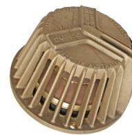
FOX DIVERSION VALVE DV150