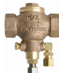
FOX DEMAND VALVE DMV25