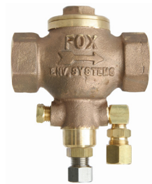
FOX DEMAND VALVE DMV25