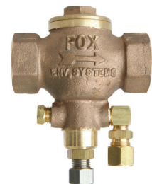
FOX DEMAND VALVE DMV25