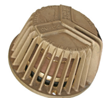
FOX DIVERSION VALVE DMV150