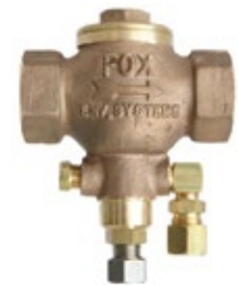
FOX DEMAND VALVE DMV25

The FF600 Diversion System is designed for larger wash pads for washing trucks, earthmoving machinery, boats, aircraft, shipping containers etc.