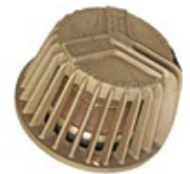
FOX DIVERSION VALVE DV150