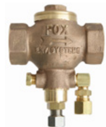
FOX DEMAND VALVE DMV25