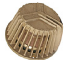
FOX DIVERSION VALVE DMV150