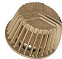
FOX DIVERSION VALVE DMV150