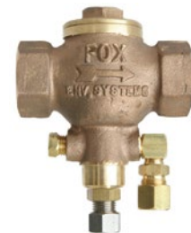
FOX DEMAND VALVE DMV25